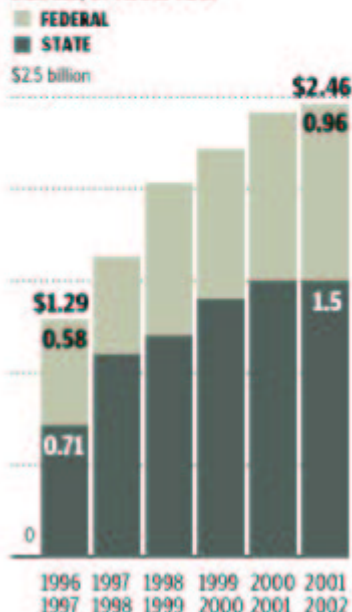
Sources: State budget documents, Senate Fiscal Agency, transportation analysts The Detroit News